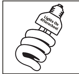
ITEM # ORIGINAL Lights On! Light Bulb Image size is 7 1/2" X 8 1/2"