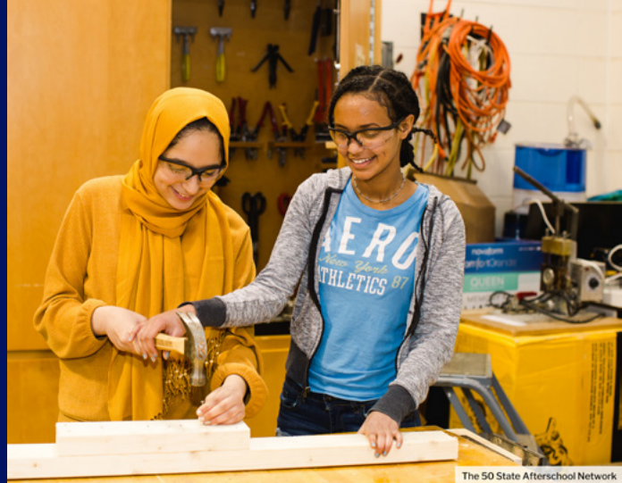
The 50 State Afterschool Network

Growing support for youth, families, and communities